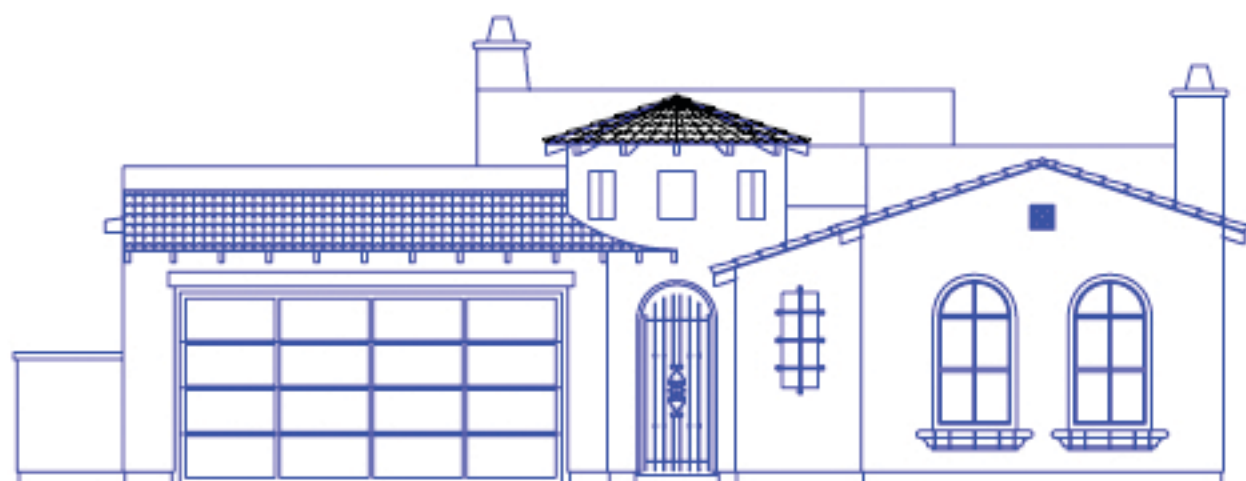
PLAN FIVE SQ. FT. AREAS