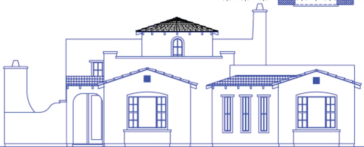
PLAN SEVEN SQ. FT. AREAS